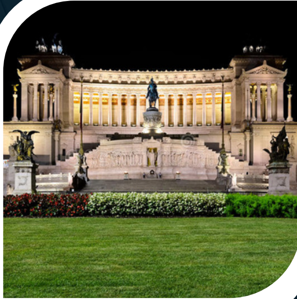
Altar of the Fatherland