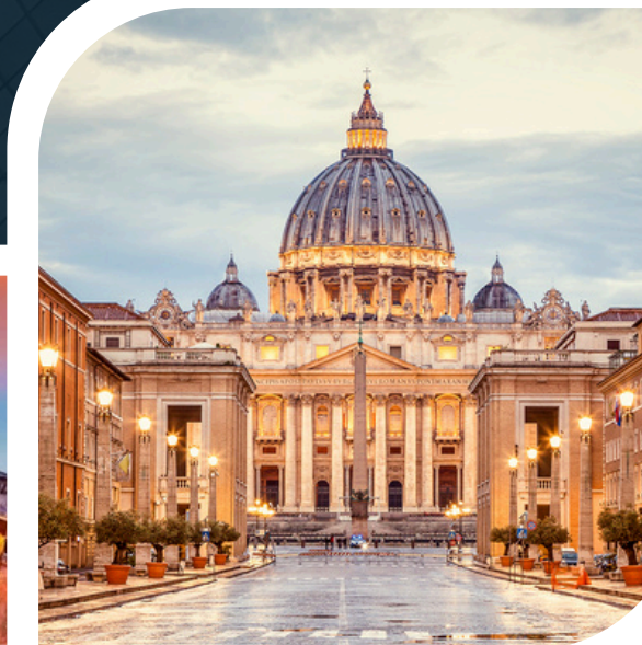
St. Peter's Basilica