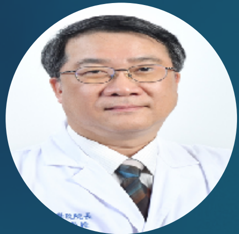
Yan-Shen Shan Taiwan