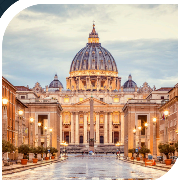
St. Peter's Basilica