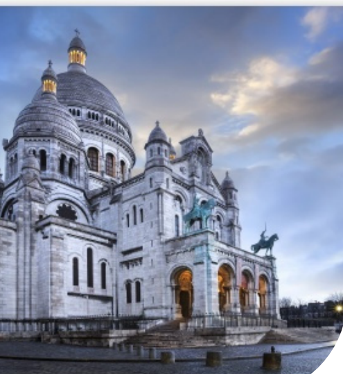
Montmartre & Sacré-Cœur