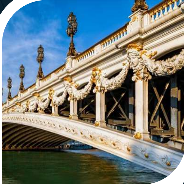
Pont Alexandre III Bridge