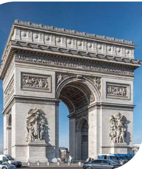
Arc de Triomphe