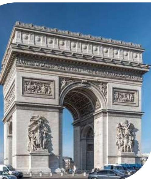
Arc de Triomphe