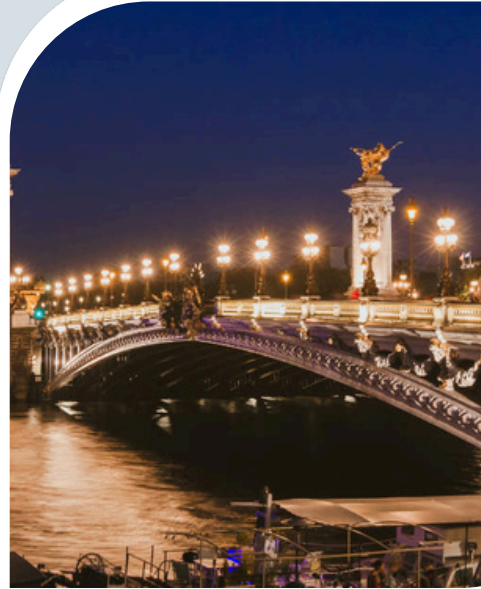
Pont Alexandre III Bridge