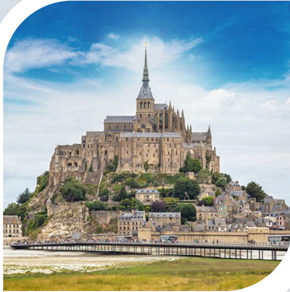
Mont Saint Michel