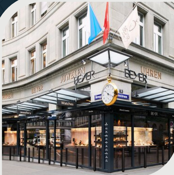
Beyer Clock & Watch Museum