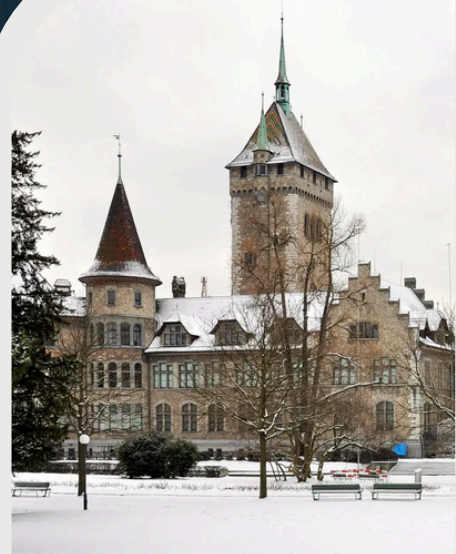
Swiss National Museum