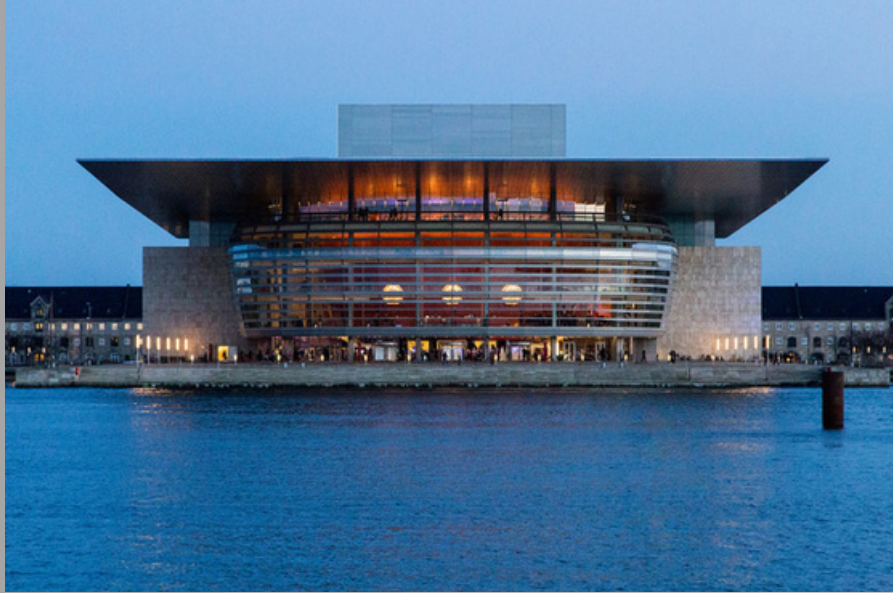
Det Kongelige Teater – Operaen