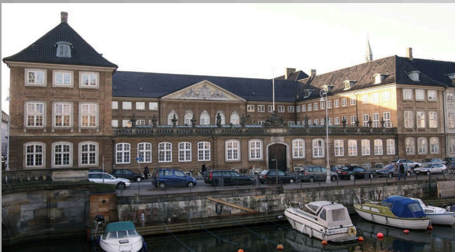
National Museum of Denmark (Copenhagen)