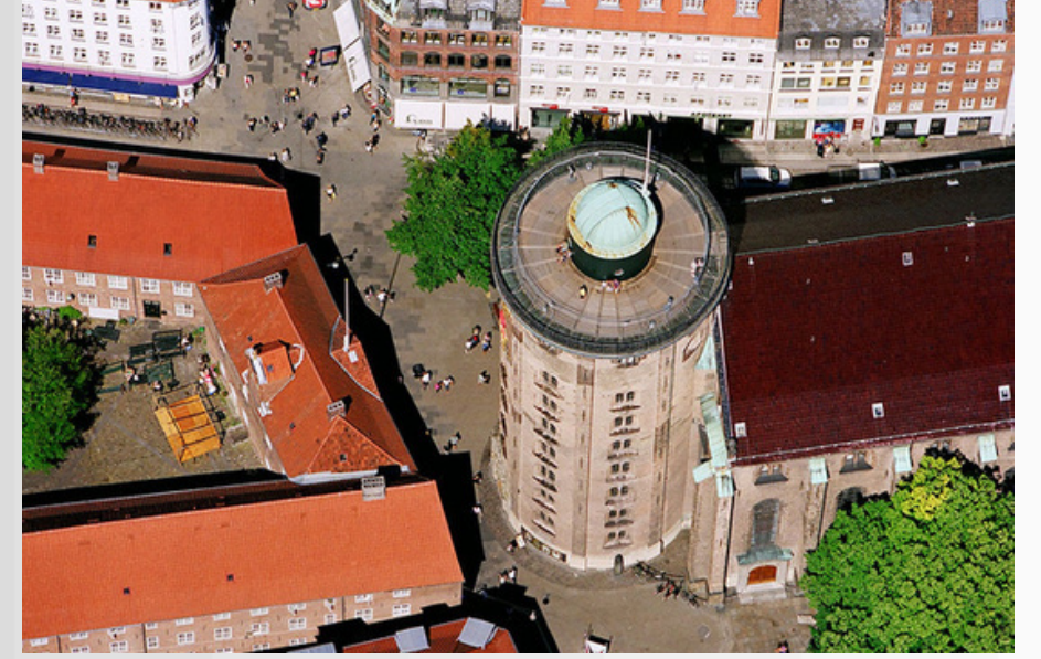
The Round Tower