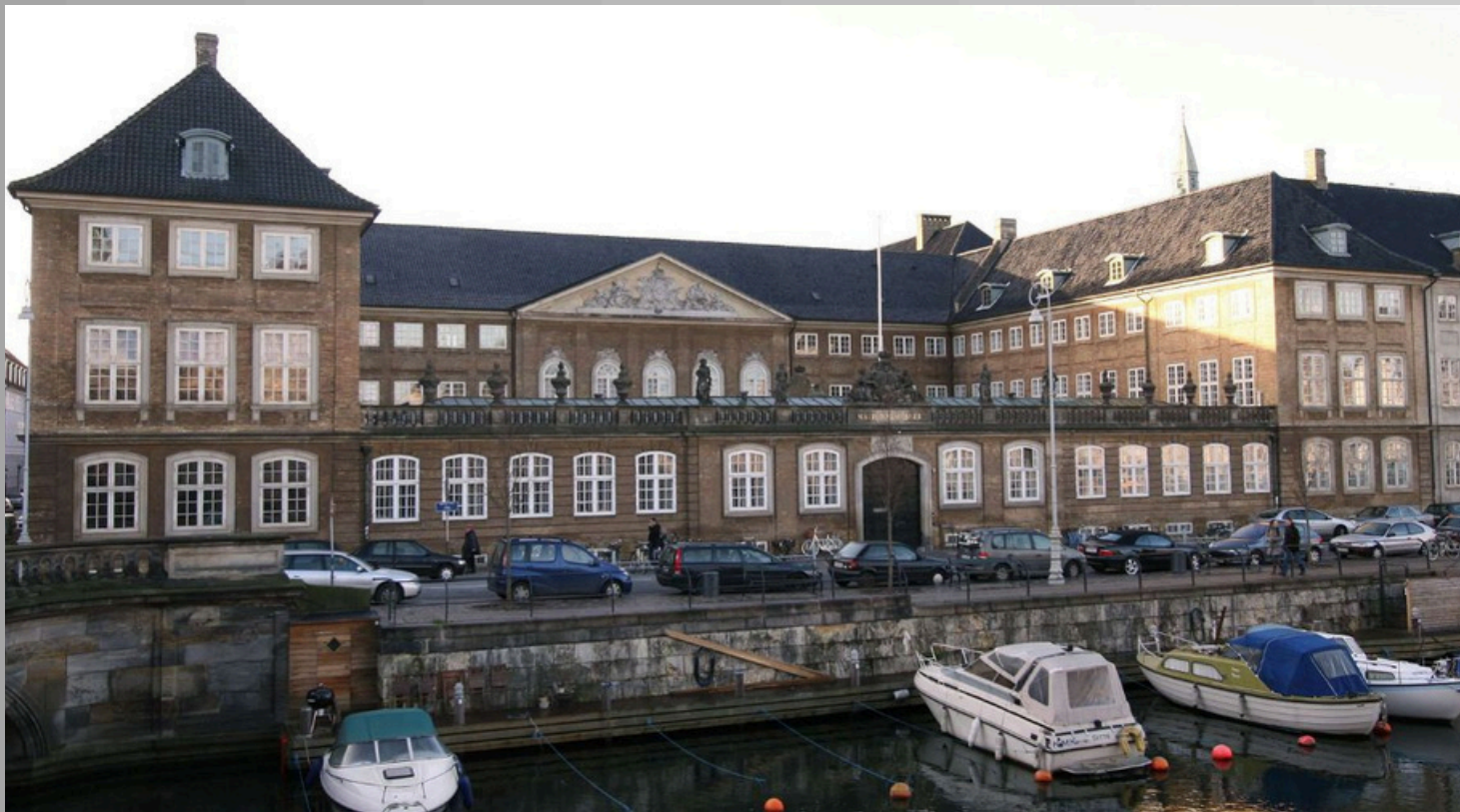
National Museum of Denmark (Copenhagen)