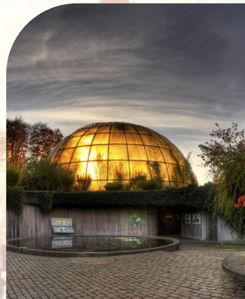
Zurich Botanical Garden