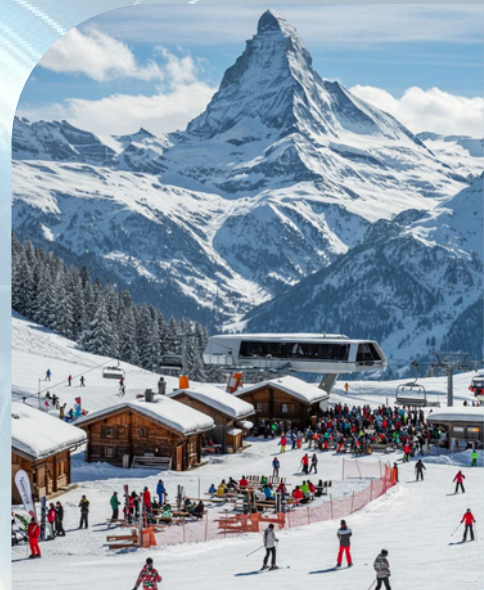
Flumserberg Ski Resort