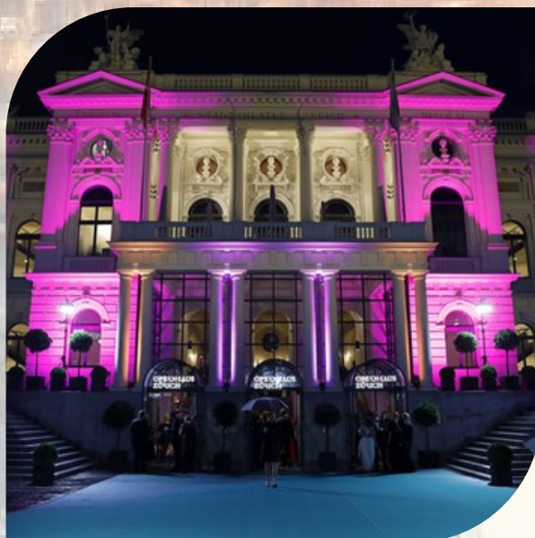
Zurich Opera House