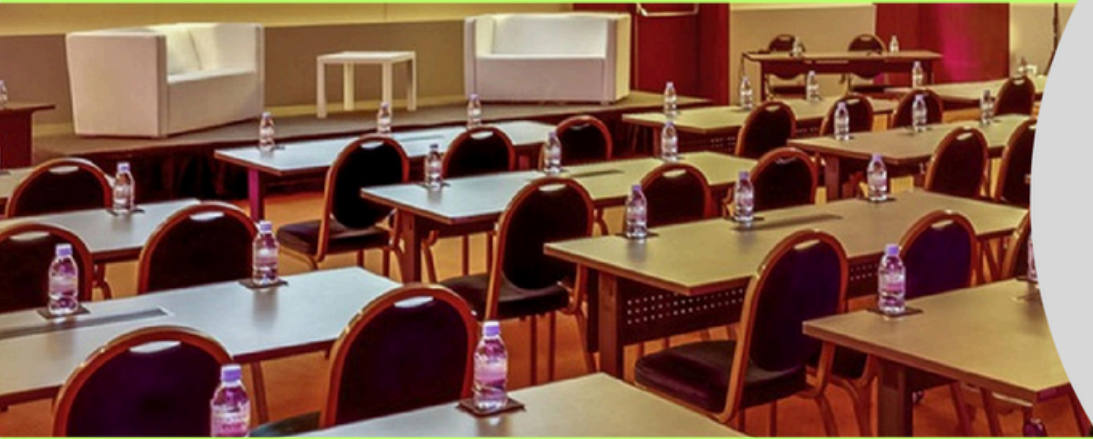
Venue & Accommodation Rome, Italy